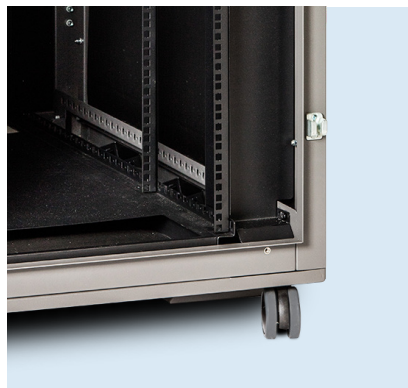
Optional Castor Plinth with Brakes