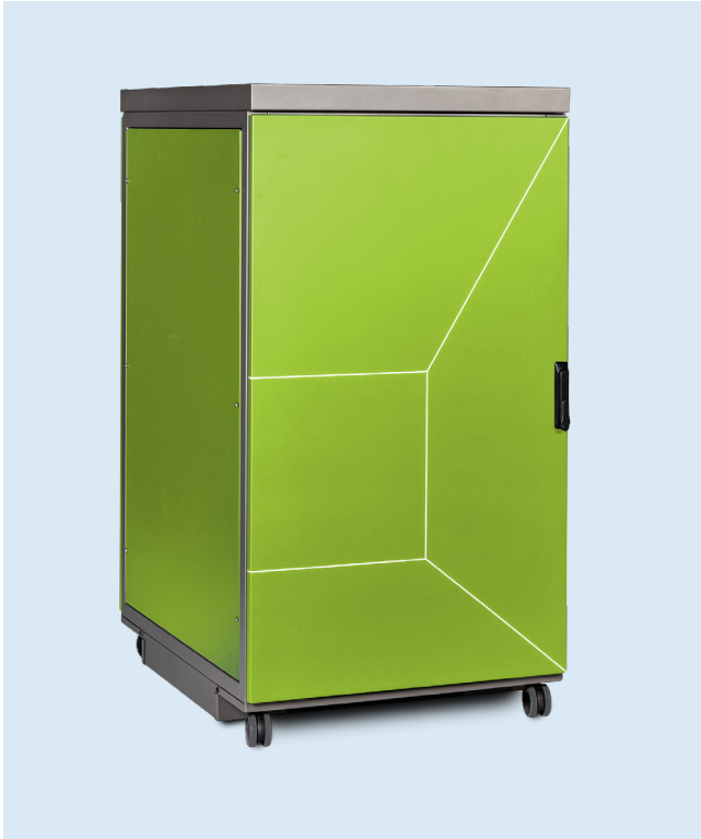
Metal Door with Multi-point Locking and Lift & Swing Handle