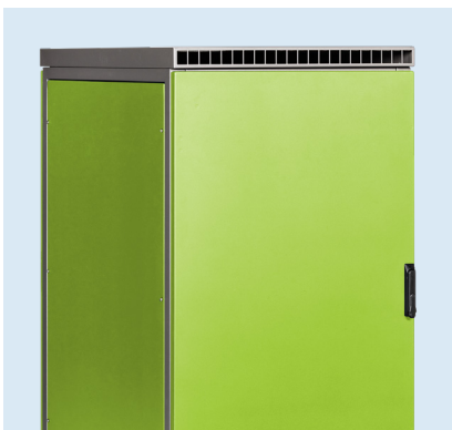
Door of enclosure showing air vents above rear door