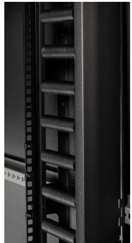
Optional Vertical Cable Ducts mounted at front of each side