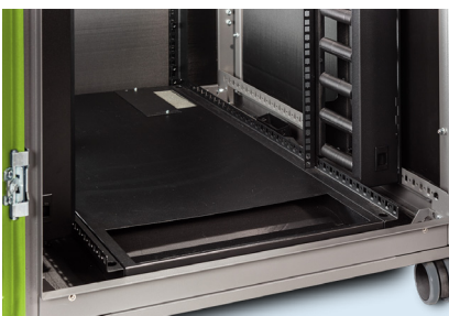
Air enters enclosure at bottom rear with Cable Entry provisions