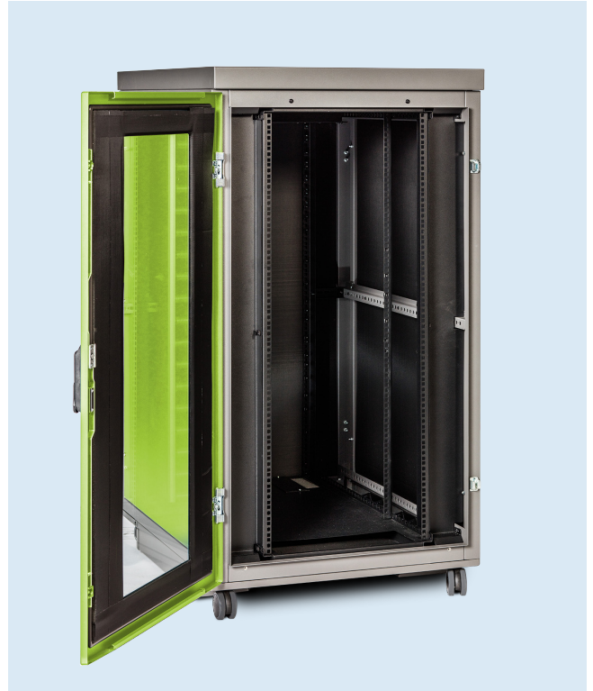
Metal Door with Optional 12mm Acoustic Glass Panel